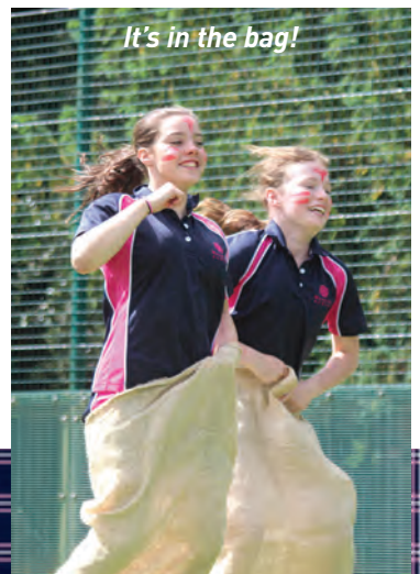
It's in the bag!