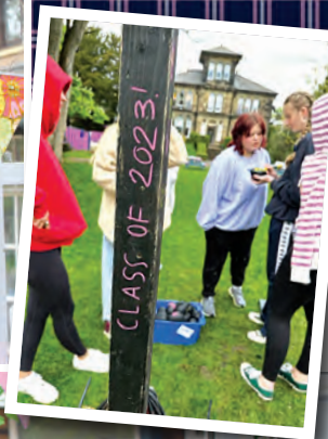
Mocktails and afternoon tea