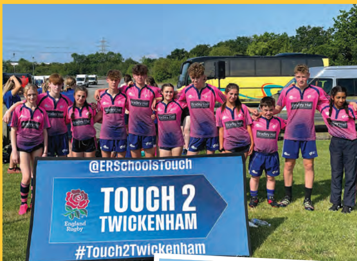
Our Y9 girls made it to the final at Sixways Stadium in Worcester for the final of the Touch 2 Twickenham mixed touch tournament.