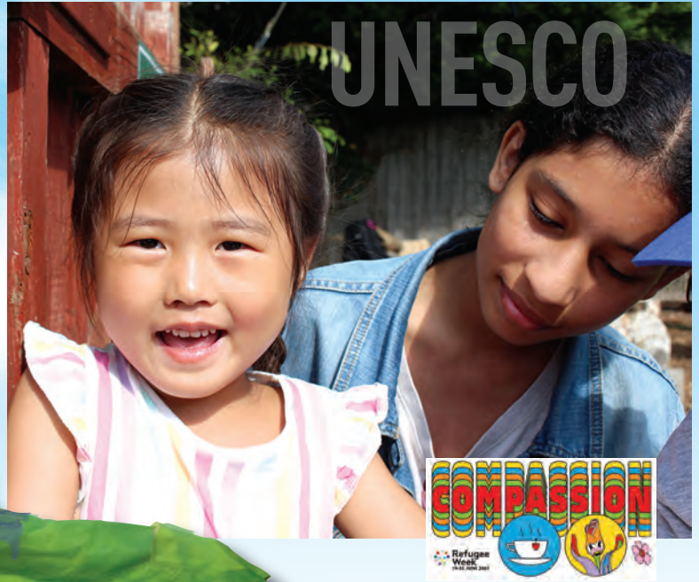
Lower 5 joined BrightStart in Forest School.

On Thursday of the same week, everyone proudly wore a 'Refugee Week' sticker and wore something bright and colourful for a non-uniform fundraising day in aid of Refugee Week.