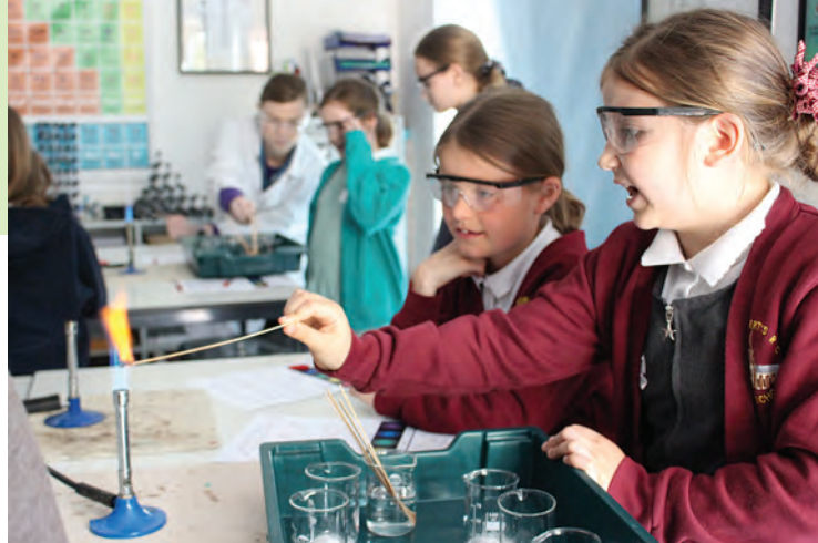
Investigating the colours in fireworks

Science, Technology, Engineering and Maths