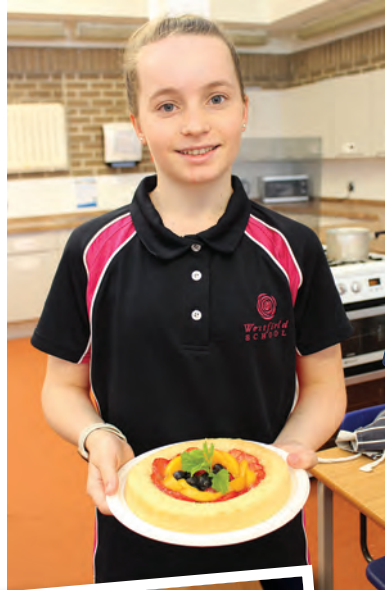
Tilly prepared a fruit tart.

Upper 3 are now confident enough to follow a recipe independently to make a full meal; Lower 4 embraced the 5 a day challenge using complex knife skills to create colourful summer fruit tarts; and Upper 4, preparing for GCSE, made some zesty jaffa cakes! Lower 5 completed their mock exam by producing a two course meal in two hours. Upper 5 and Lower 6 all achieved grade 7 to 9 in their final practical exams this year and I am so proud of the dishes they produced, from homemade cheese in a ravioli dish, Mille Feuille and vegan meringues to deboning chickens for Mexican flatbreads.