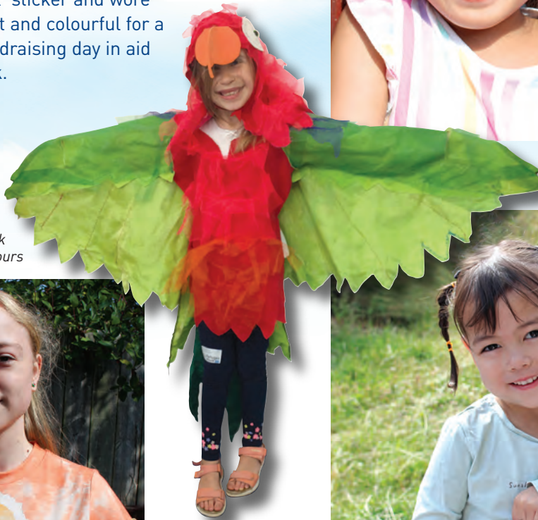
Polly the colourful parrot

The whole school marked Refugee Week by wearing bright colours