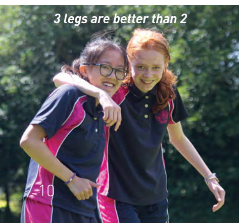
3 legs are better than 2